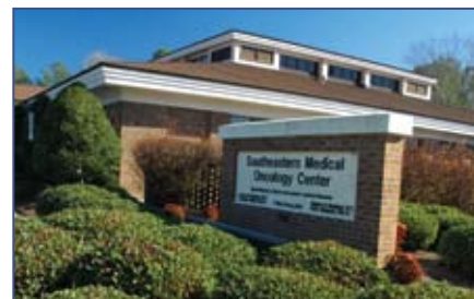
Southeastern Medical Oncology Center