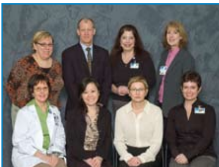
Virginia Mason Continence Center Team

mal childbirth, hormonal changes or simple time and gravity, urinary incontinence affects over 13 million Americans, most of whom are women. For the vast majority, we can reduce or completely eliminate the problem.”