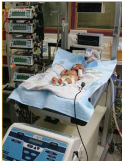
State-of-the-art technologies at Children's Mercy include therapeutic hypothermia to prevent long-term brain damage, ECMO therapy to treat heart and lung failure, and leading-edge clinical research trials.